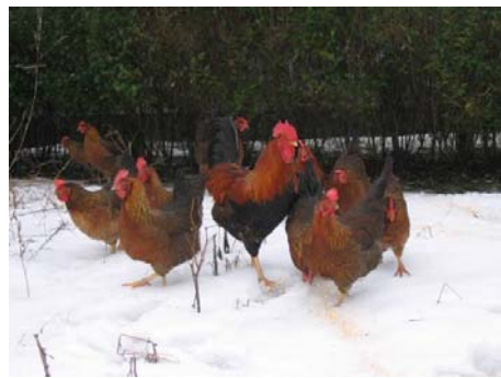
Partridge colour Hungarian chicken (Gödöllő, 2005)